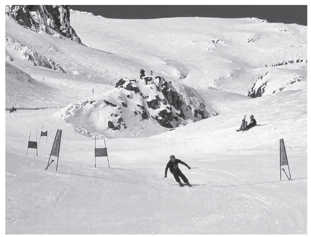
Skiing in the Combined Clubs Race.