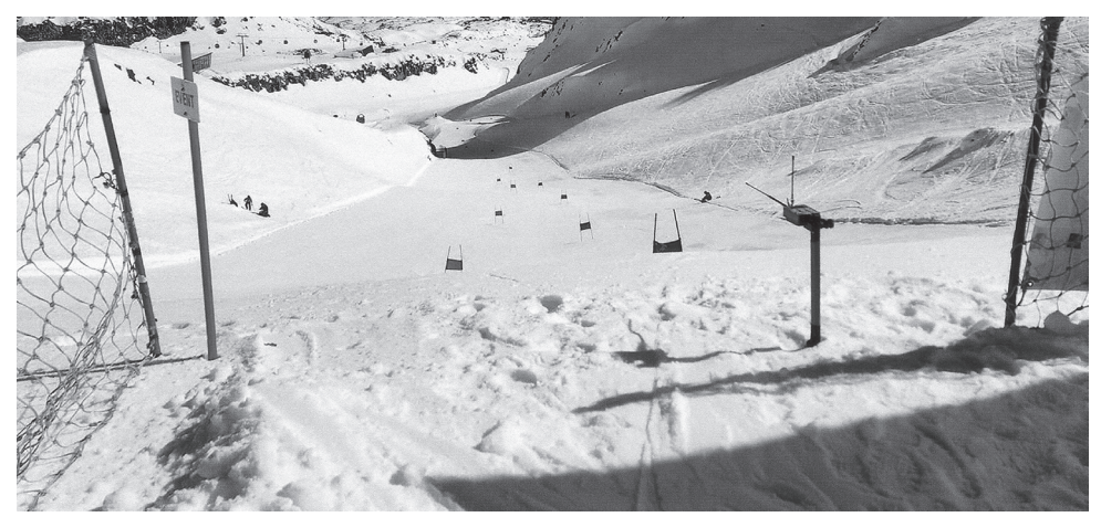
The course in Pinnacle Valley for the Combined Clubs Race 2023.