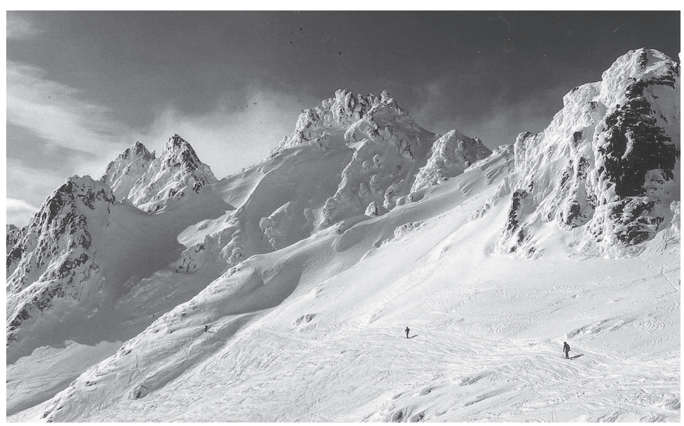
Skiers on the Pinnacle Traverse at Whakapapa in August 2023.