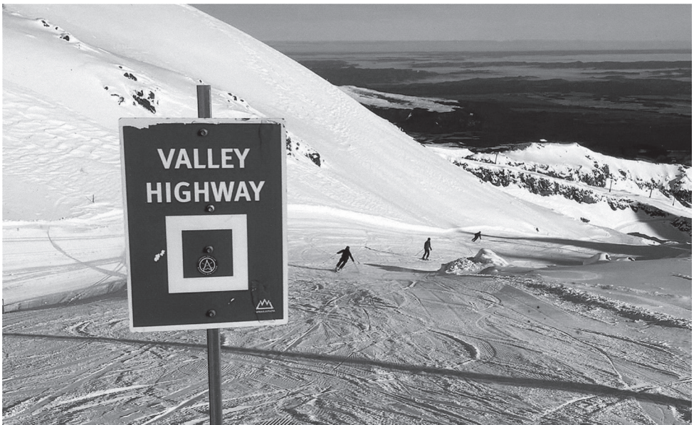
Nice snow for skiing at Whakapapa.