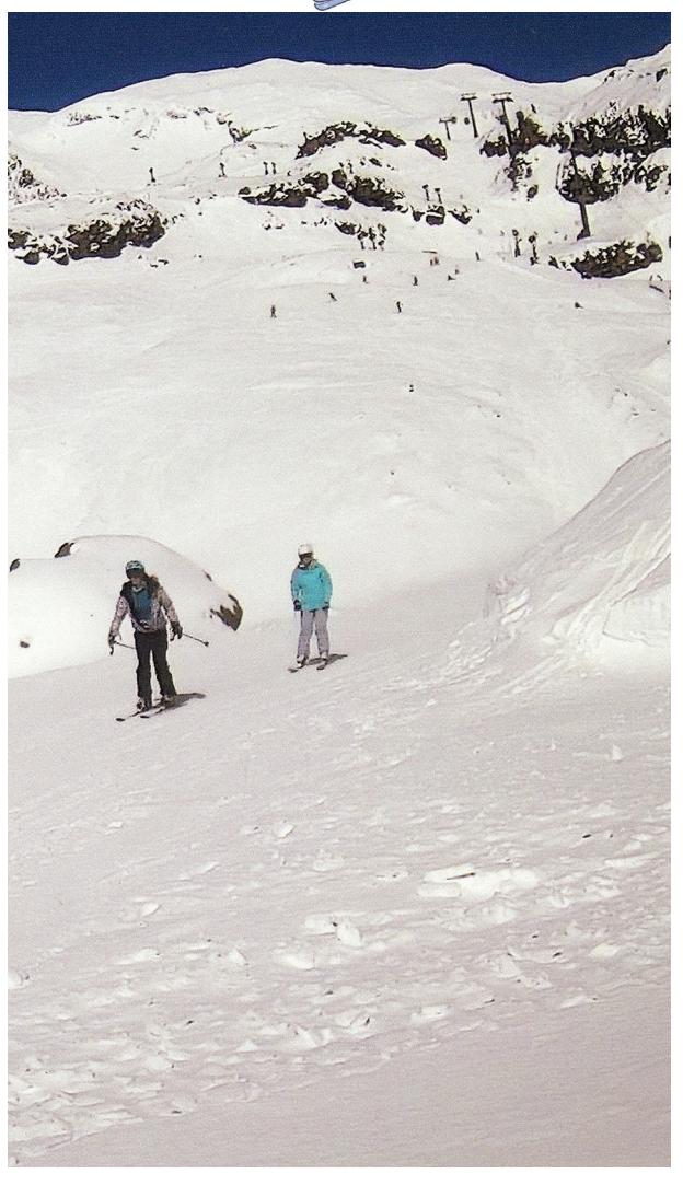
The Staircase at Whakapapa in September 2023. This was the best snow we have had for several years.