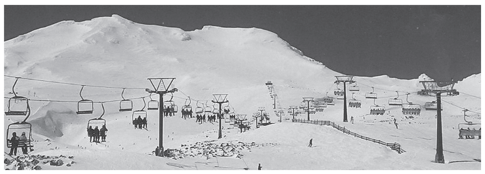
Skiing at Turoa in 2023.