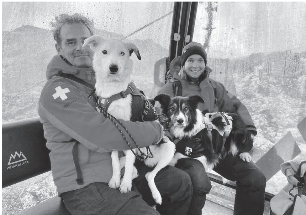
Upper: This avalanche at Whakapapa this year was started by customers visiting a closed area. Lower: Avalanche rescue dogs Sky and Echo take a ride on the Sky Waka.